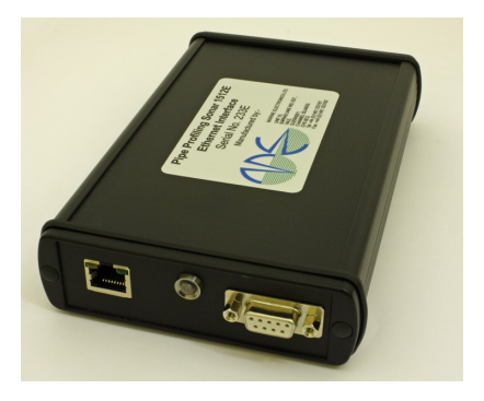
Stand-alone Ethernet Interface Unit